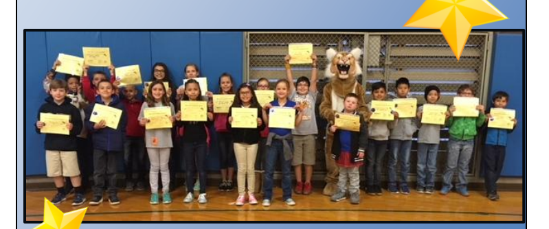
Most Improved Bobcats!