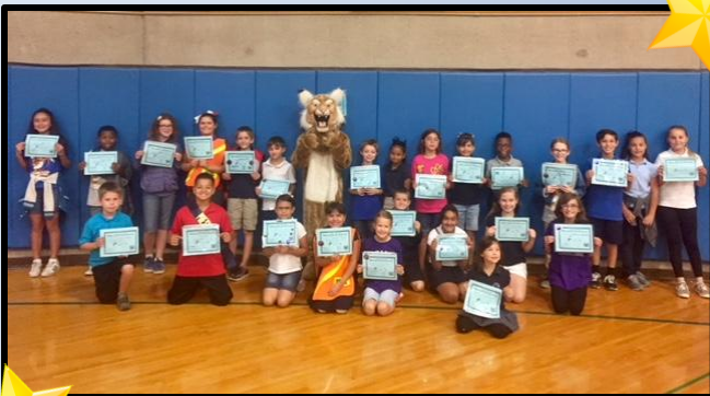
Bobcats of the Month!