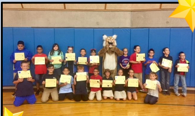
Most Improved Bobcats!