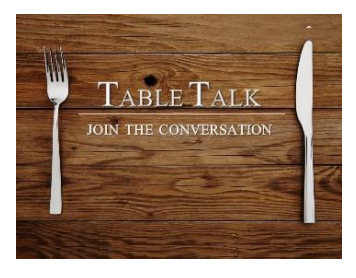
TABLE TALK for the Week of Dec 4-Dec 8.

Here are some of the activities going on this week both in class and throughout the school that you could discuss at the dinner table, in the car, or anytime with your child. As always, please contact me with any questions/issues.